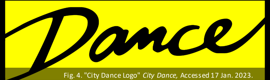
Fig. 4. "City Dance Logo" City Dance , Accessed 17 Jan. 2023.