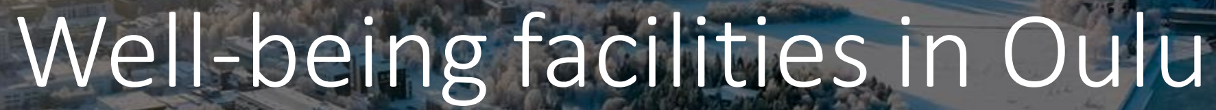
Fig. 1. Ota Haltuun Oulu – Asteen Verran Parempi Pohjoinen Kaupunki.” Oulu , oulu.com/oulu/ . Accessed 17 Jan. 2023.