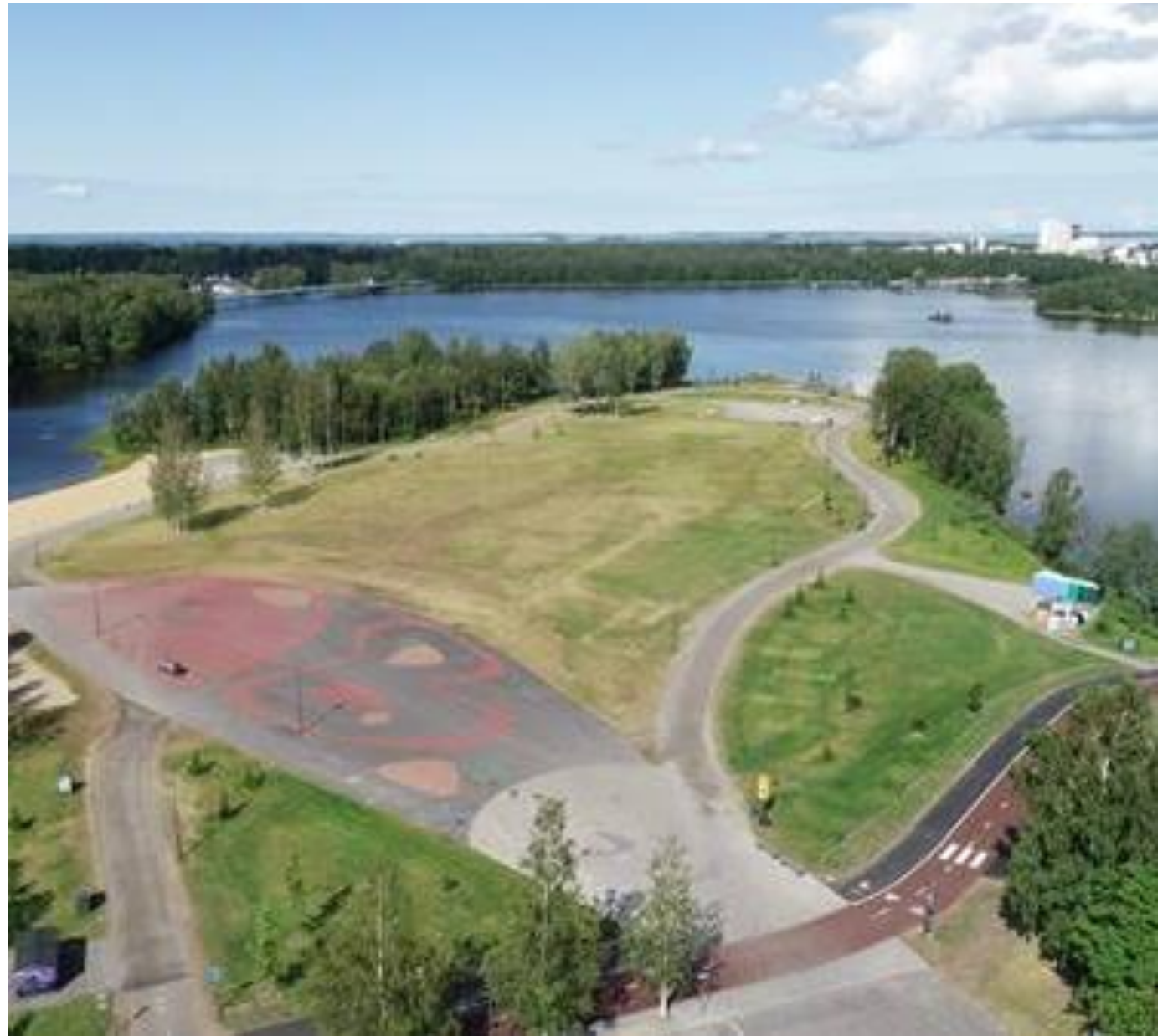
Fig. 1. "Kuusisaari" Ramboll, Accessed 17. Jan 2023