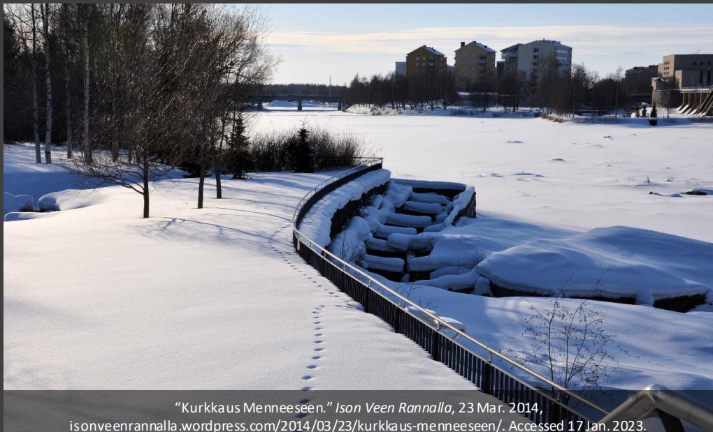
"Kurkkaus Menneeseen." Ison Veen Rannalla , 23 Mar. 2014, isonveenrannalla.wordpress.com/2014/03/23/kurkkaus-menneeseen/ . Accessed 17 Jan. 2023.