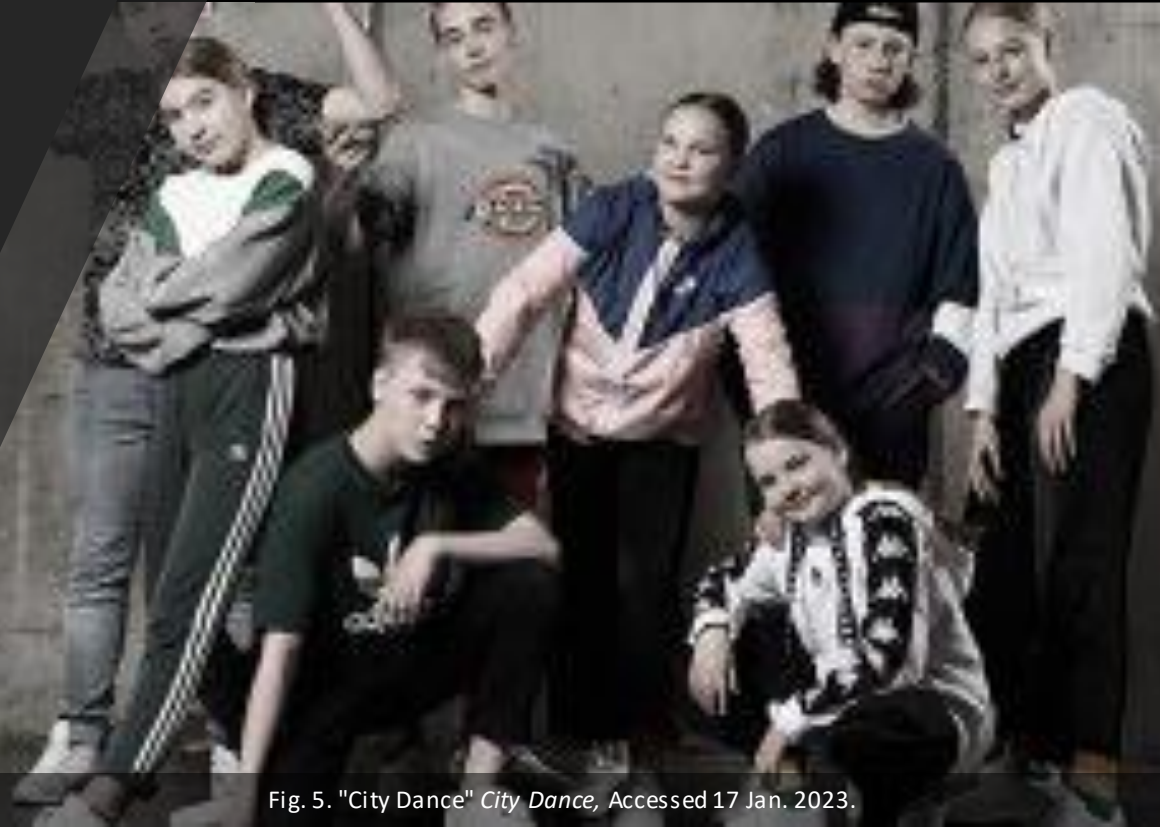
Fig. 5. "City Dance" City Dance , Accessed 17 Jan. 2023.