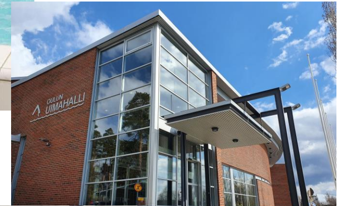
Fig.7. "Oulun uimahallin kuntosali," Ouka, Accessed 17 Jan 2023.